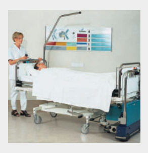
Mechanized assistance to move beds or cabinets