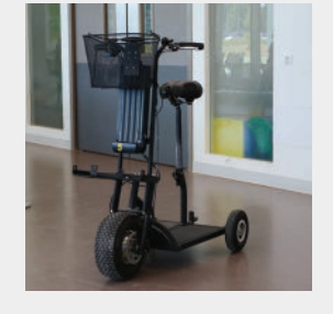
Electric scooter to optimize staff's long distance movements