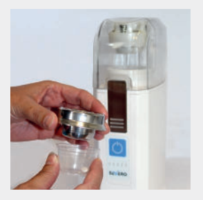
Electrical pill crushing to avoid manual crushing